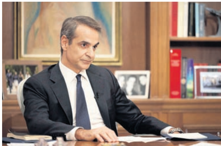
In this photo provided by the Greek Prime Minister's Office, Greece's Prime Minister Kyriakos Mitsotakis listens a question during an interview on Greece's ANTENNA TV, in Athens, Monday, Nov. 7, 2022. Mitsotakis said U.S. oil giant ExxonMobil will "in the coming days" start seismic exploration for potential natural gas deposits in the Mediterranean Sea off southwestern Greece.

the potential risk of spills, and say the project, if successful, would increase